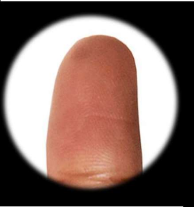
10 times size