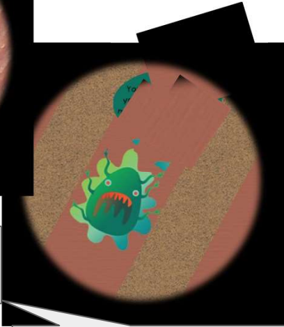
200 times size... GERM ALERT!!