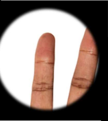
3 times size